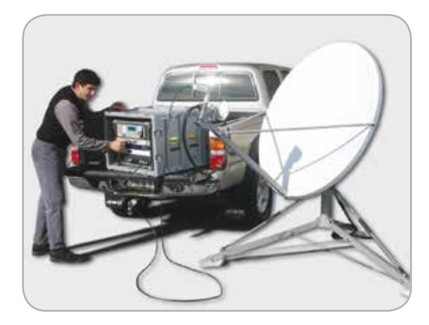
Using the provided electronics rack and antenna system, you can start transmitting your program over satellite from anywhere in the world in less than 30 minutes!