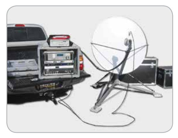
Our integrated and self-contained transportable rack contains all the electronic equipment necessary to uplink and monitor your program. Complete front access makes operating the system a user friendly experience.