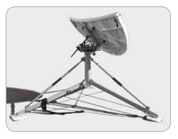
Due to light and smart design, the antenna system can be assembled in about 10 minutes with no tools required!