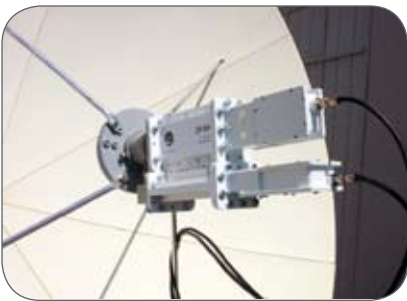
ZF150 mounted on a parabolic antenna feed