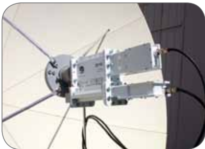
ZF150 mounted on a parabolic antenna feed