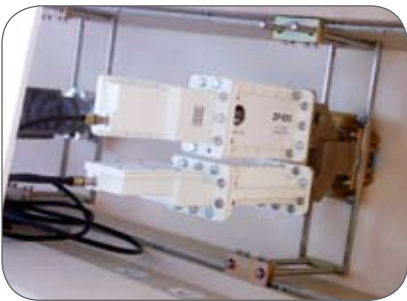
ZF150 mounted on a Simulsat antenna feed