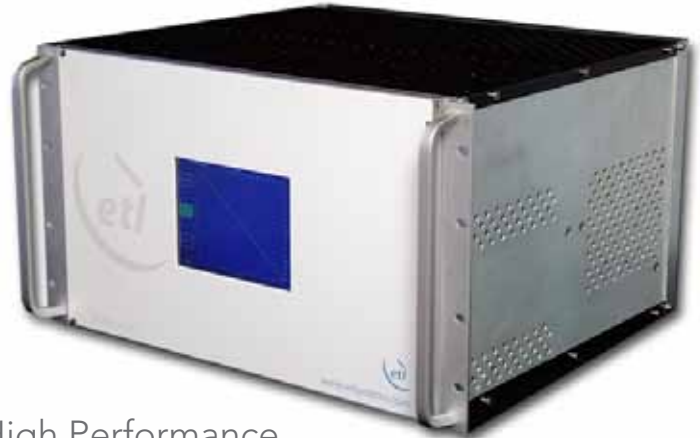
High Performance L-Band Router