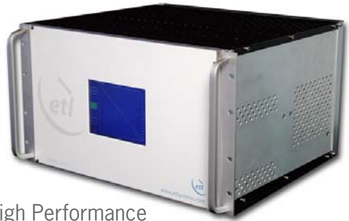
High Performance L-Band Router